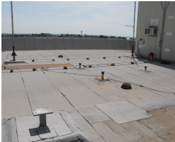
Left antenna is 146.805 & Right antenna is 444.95. New mounts for the masts of these two antennas