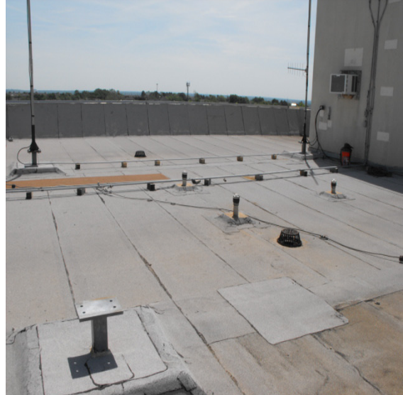
Left is 146.805 antenna and right is 444.95 & link antennas