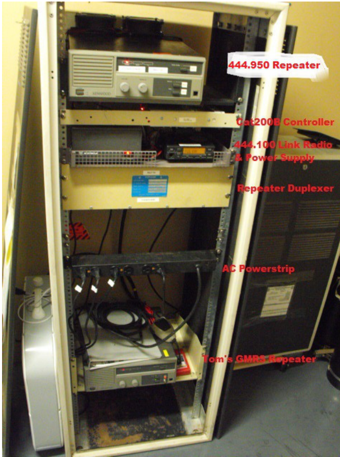
Multiple repeater/link equipment cabinet