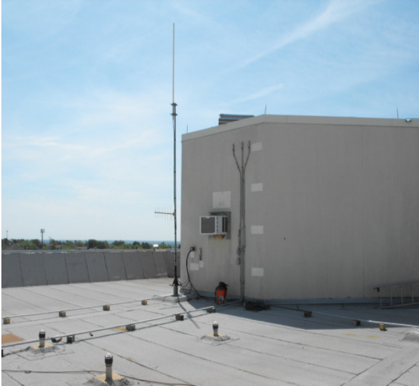
444.95 & Link antenna