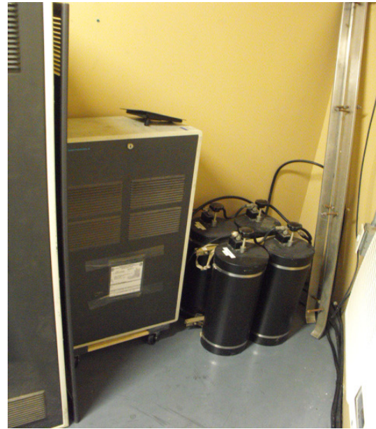
146.805 repeater cabinet & duplexer