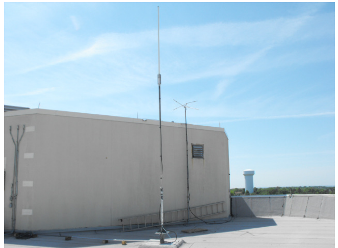
GMRS & LPFM antennas