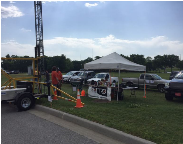
Left – the TRO table setup with the USS Batfish portable tower.

PAGE 1 Prez Says Camp Bandage PAGE 2 Maple Ridge Run Membership Meeting Minutes of 04/24/18 PAGE 3 Tour de Cure Membership Meeting Minutes of 05/22/18 PAGE 4 Membership Meeting Minutes of 05/22/18 - continued PAGE 5 TRO Treasury Report Activities Engineering Report PAGE 6 Club Meetings VE Test Sessions PAGE 7 Hamfests Making Contact PAGE 8 TRO Officer Contact Information